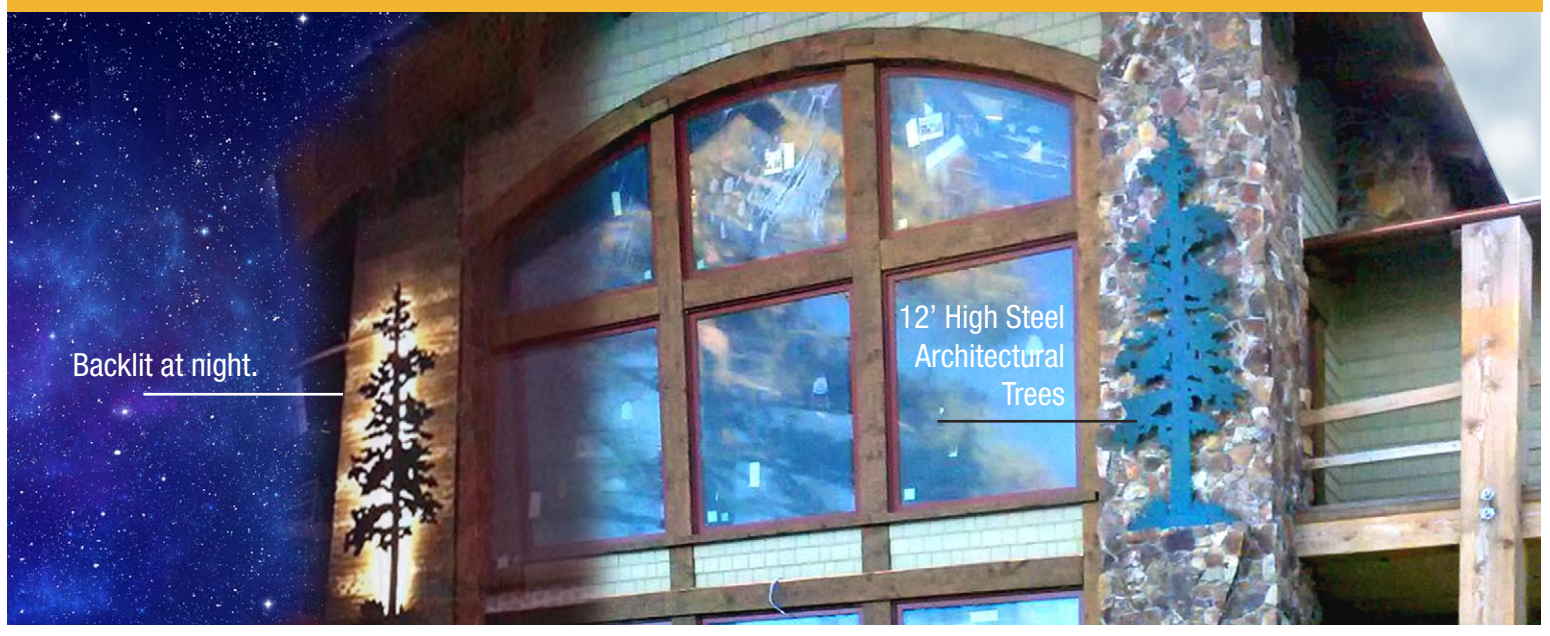
WOSB • WBE • MBE • SB • SB-PW • CADIR