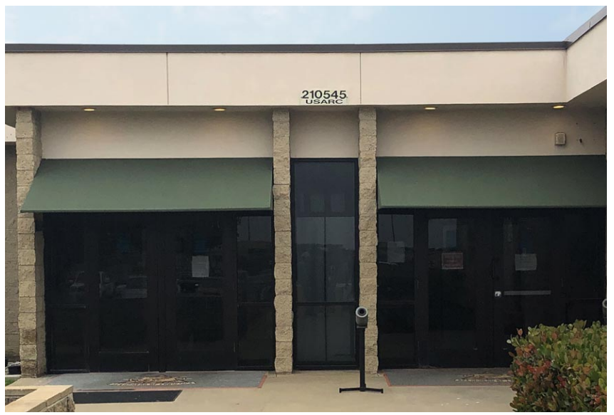
USMC building awnings