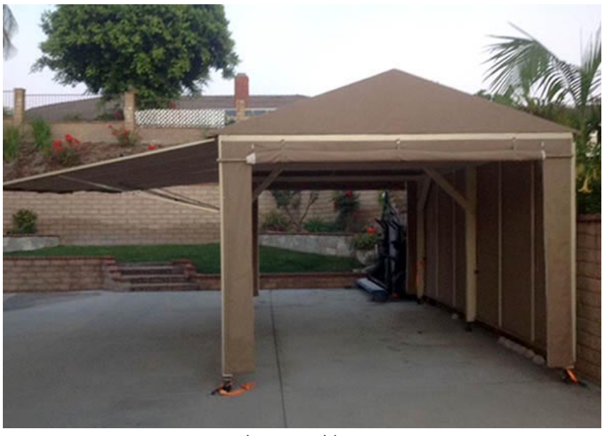
Outdoor portable room